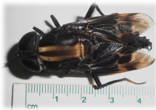
Fig. (3). Female coloration and characteristics of P. bellardii .