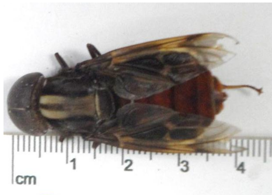
Fig. (4). Male coloration and characteristics of P. bellardii .