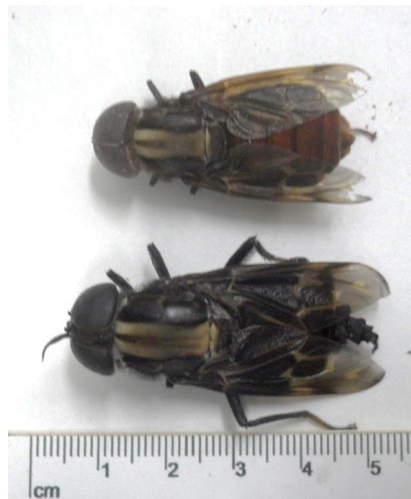
Fig. (2). Dorsal view of the male (upper) and female (lower) of P. bellardii collected at Sartenejas Valley, Miranda Venezuela.