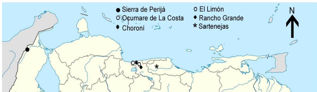
Fig. (5). Location of the current record of Pantophthalmus bellardii in Northern Venezuela (see legend inside the map).