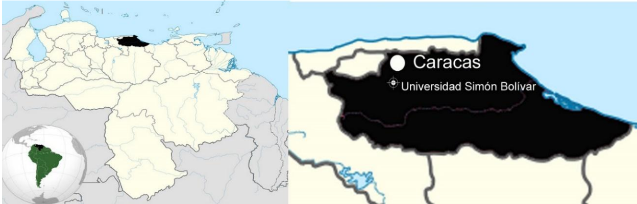
Fig. (1). Venezuela map with the location of the Universidad Simón Bolívar where the specimens were found.

The presence of P. bellardii at Sartenejas Valley (Miranda Venezuela) at 1200 meters above sea level, is an important extension of the altitudinal profile of the Panthophthalmidae records in Venezuela. It is also the first record of this family for the Miranda State.